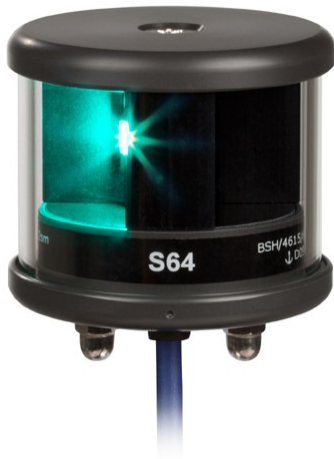
S64 für Montagehalter (Standard) S64 for mounting bracket (Standard)