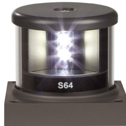
S64 mit Grundplatte S64 with base plate